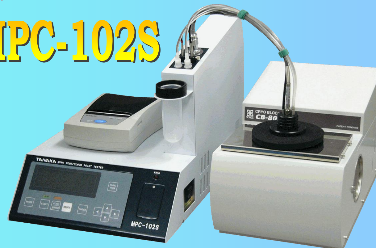
MPC-102S shown with optional printer "BS2-80TS"