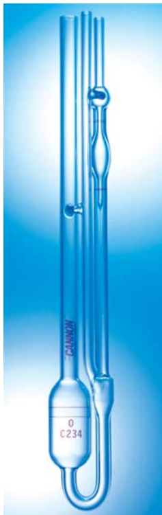
9721-N50 Series 9721-R50 Series 9721-U50 Series