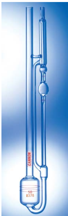
9721-J50 Series 9721-K50 Series

Holder is not supplied. For holders, see 9726-M70, -M73, and -M76 on page 15.