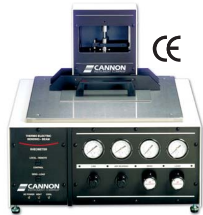
CANNON® Thermolectric Bending-Beam Rheometer

To use the Windows software, the TE-BBR requires an IBM®-compatible computer running Windows XP, 16 MB of memory (RAM), 10 MB of available hard disk space, a high density 1.44 MB 3.5” floppy drive, and one available RS-232 serial interface port. Software for DOS operation of the TE-BBR is also available.